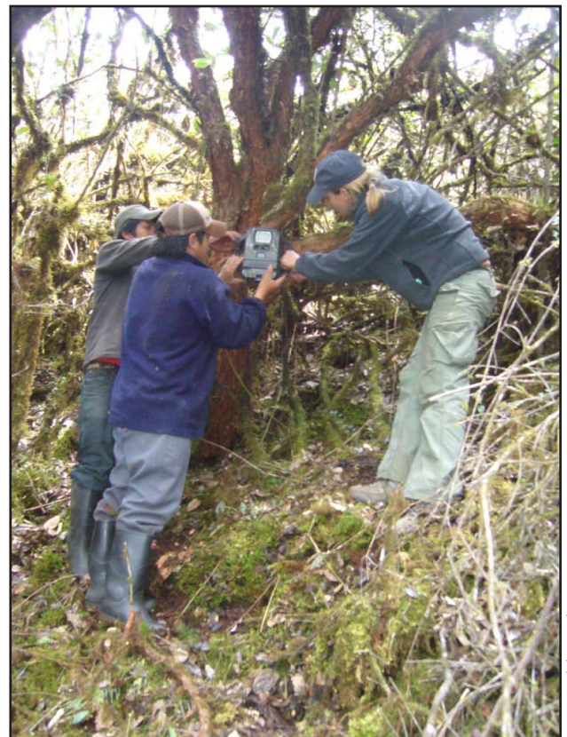
CCL staff teach community park guards to arm cameras at trap site. Left to right: Fabian Tamay (park guard), Marco Pesantez (park guard), Becky Zug (CCL)

In 2008, Zug (2009) deployed 17 camera-trap stations for 2,472 trap-nights, yielding 28 individual bear visits. Five individuals were identified, but many photo-captures were partial shots of bear feet, paws, or chest that did not enable individual identification. In 2009, Jones (2010) monitored the area for 899 trap-nights