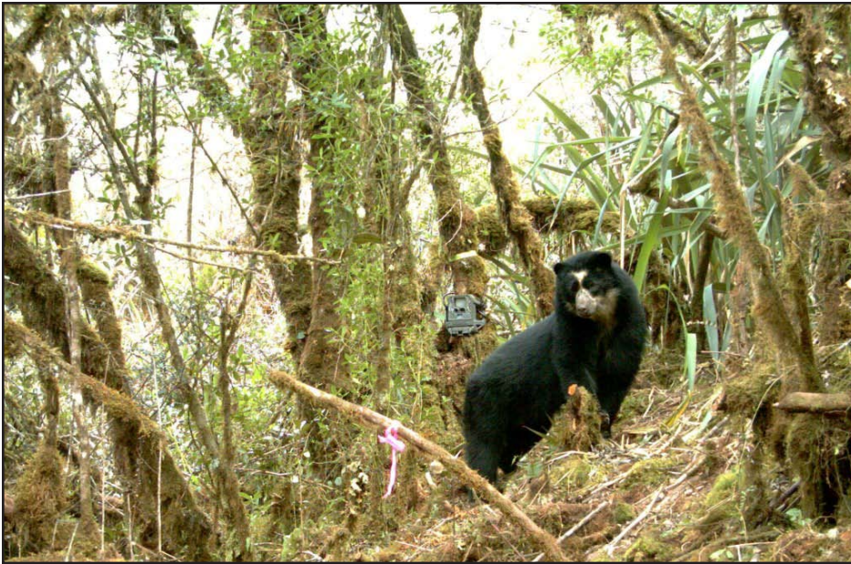
Andean bear photo-captured in camera trap

biodiversity on 1,935 ha of communally-owned montane forest, the company will construct and equip a new cheese factory in the community. Concurrent with these efforts, FCT partnered with a national initiative led by Ecuador's Ministry of Environment called Socio Bosque, aimed at providing private landowners and indigenous communities with direct remuneration in return for the conservation of native habitats. These programs are conserving ~2,500 ha of tropical montane evergreen forest and páramo landscapes throughout the southern region of Sangay National Park.